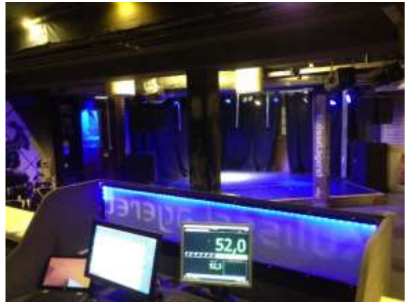
View from FOH to stage